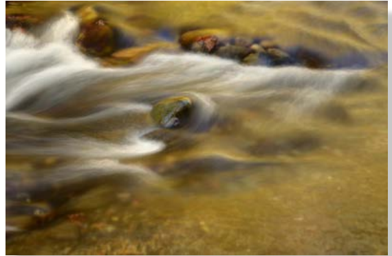
1 st Place Sharon Gerig