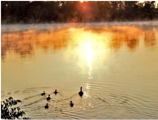
1 st Place Shirlee Reeves