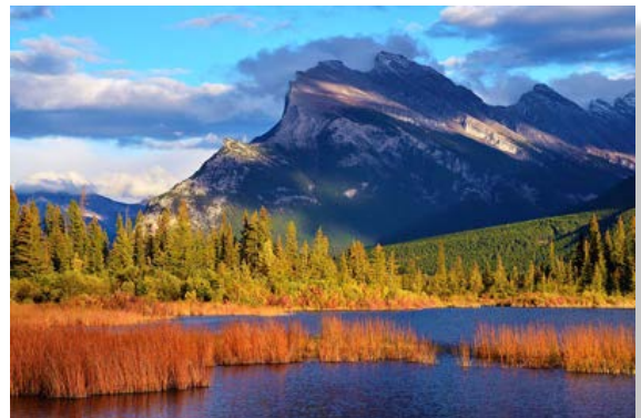
3 rd Place Lynn Gerig