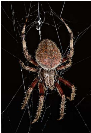
2 nd Place Brian VanDeKeere