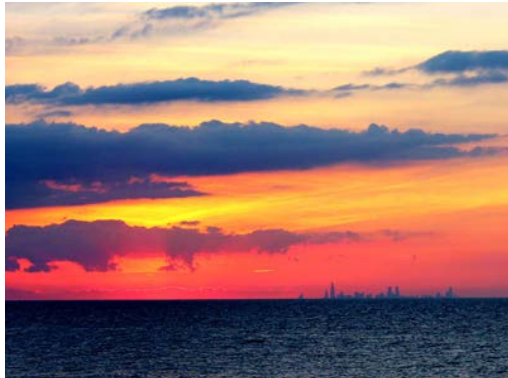
2nd Place Shirlee Reeves