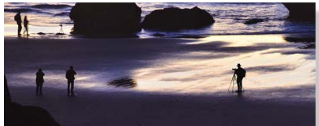
2nd Place Lynn Gerig