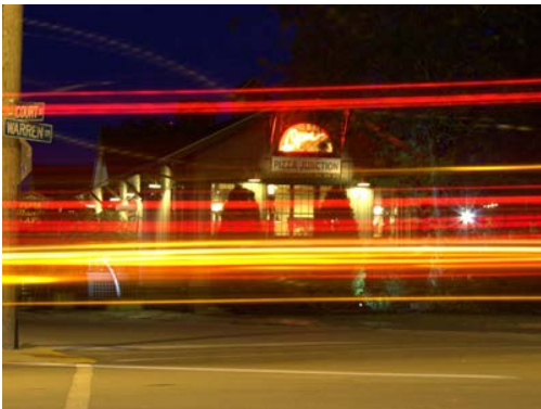
3 rd Place Shirlee Reeves