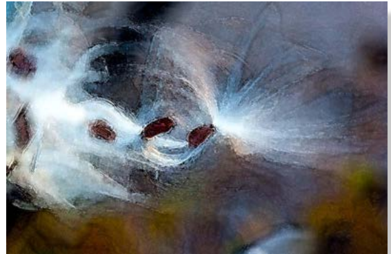
2 nd Place Forrest Van Gundy