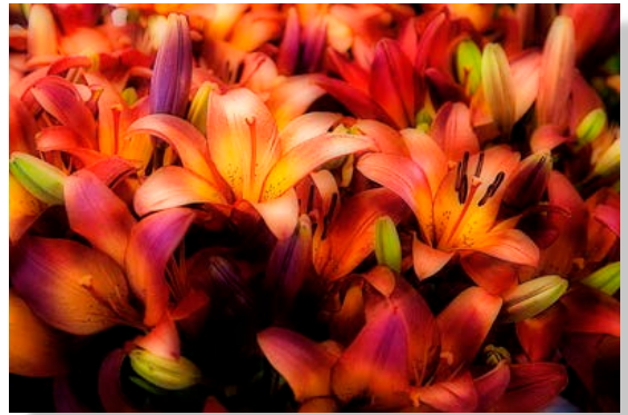
1 st Place Eugene McQuillan