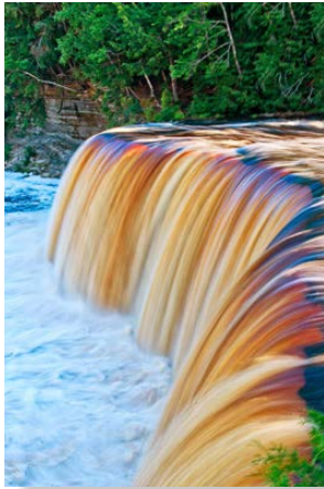
2 nd Place Brian Sirois