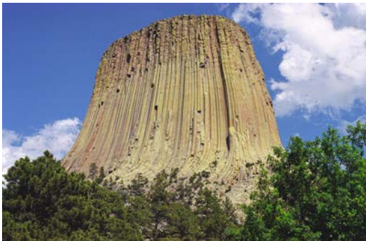
3 rd Place Jeff Chilton The Tower