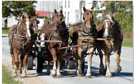
2 nd Place Don Gagnon An 8 Horsepower Engine