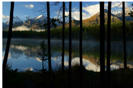
3th Place Sharon Gerig Forest Edge