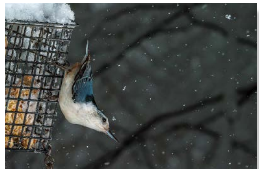
3 rd Place Larry Kilgore Surviving The Harsh Winter