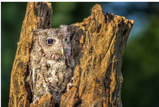
3 rd Place Sharmalene Gunawardena