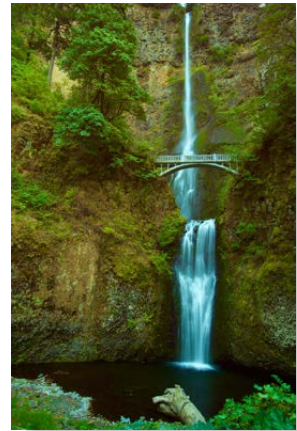
2 nd Place Lee Conkey