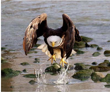
1 st Place Chad Taylor