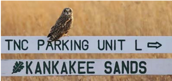
1 st Place Chad Taylor