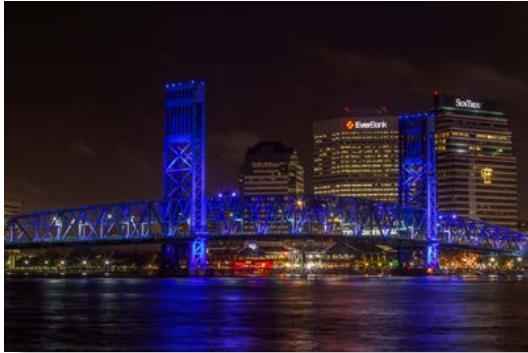
1 st Place Sharmalene Gunawardena