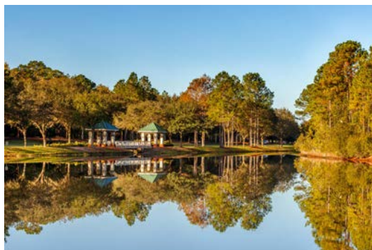
3 rd Place Sharmalene Gunawardena