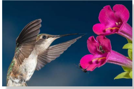
1 st Place Larry Kilgore