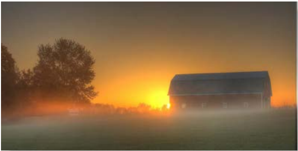
2nd Place Jim Wulpi