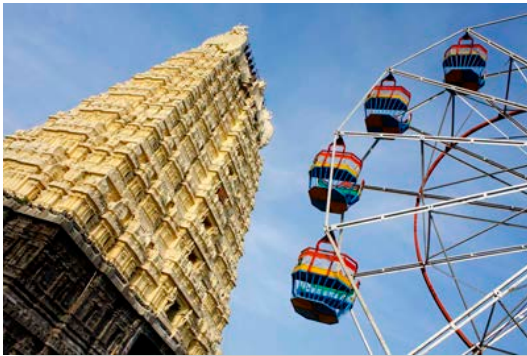
2 nd Place Prem Anandh