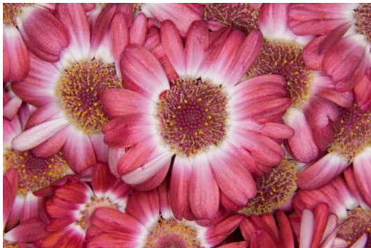
2 nd Place Jeff Chilton