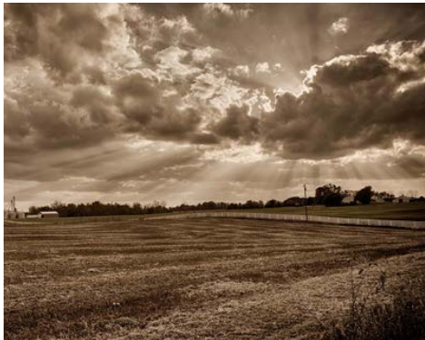
3th Place Don Gagnon