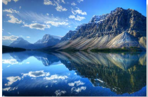
1 st Place Sharon Gerig