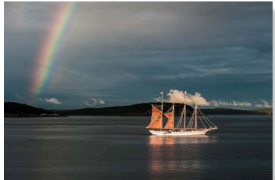
2 nd Place Rainbow For Sail Larry Kilgore