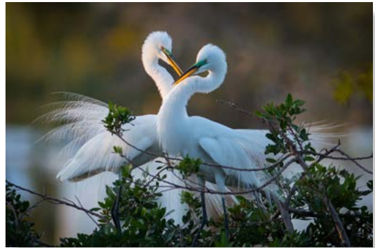
1 st Place Egret Courtship Forrest VanGundy