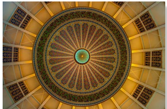
3 rd Place There's No Place Like Dome Larry Kilgore