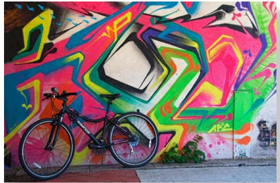
1st Place Sign Of The Times Brenda Fishbaugh