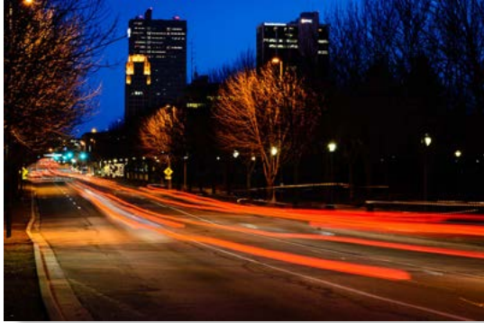
1 st Place Nighttime Drive Sarah Pringle