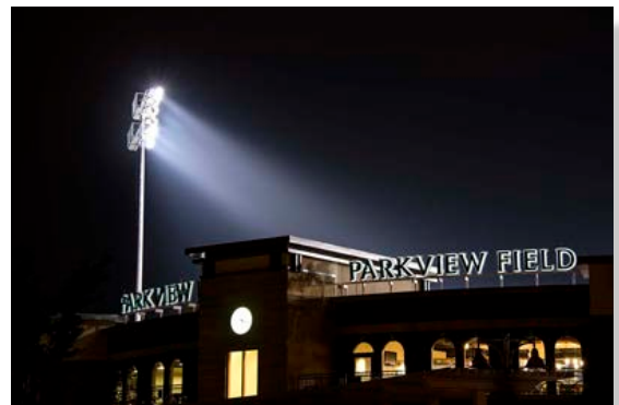
3rd Place Night Game Don Gagnon